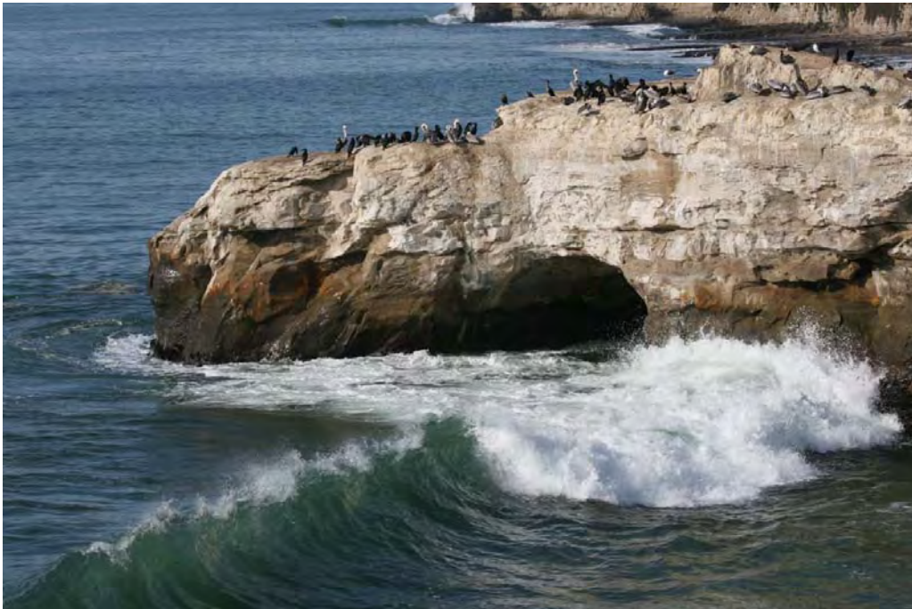
Coastline near Natural Bridges State Beach, Santa Cruz County