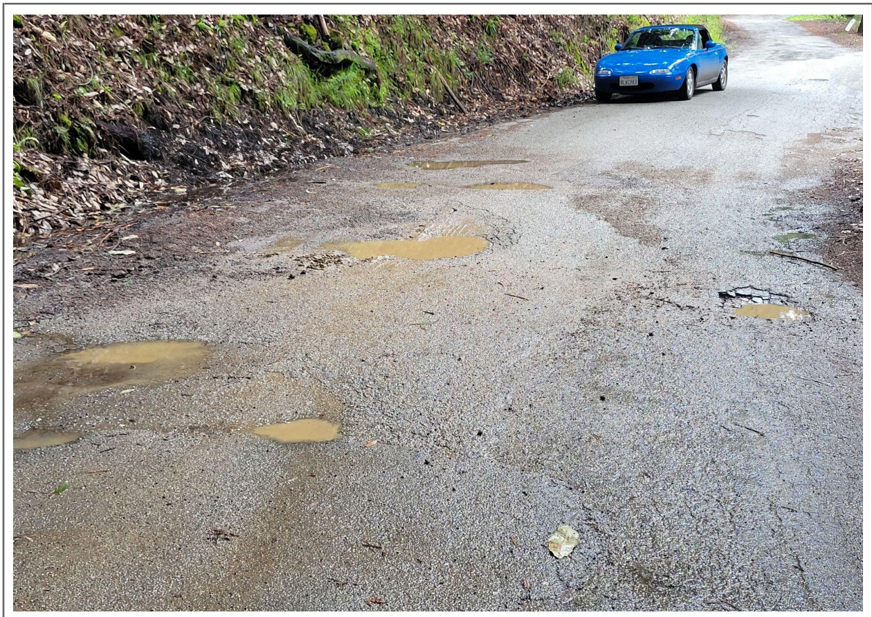
Figure 1. Laurel Road Pavement Condition Index (PCI) 10 in 2019 report. [1]