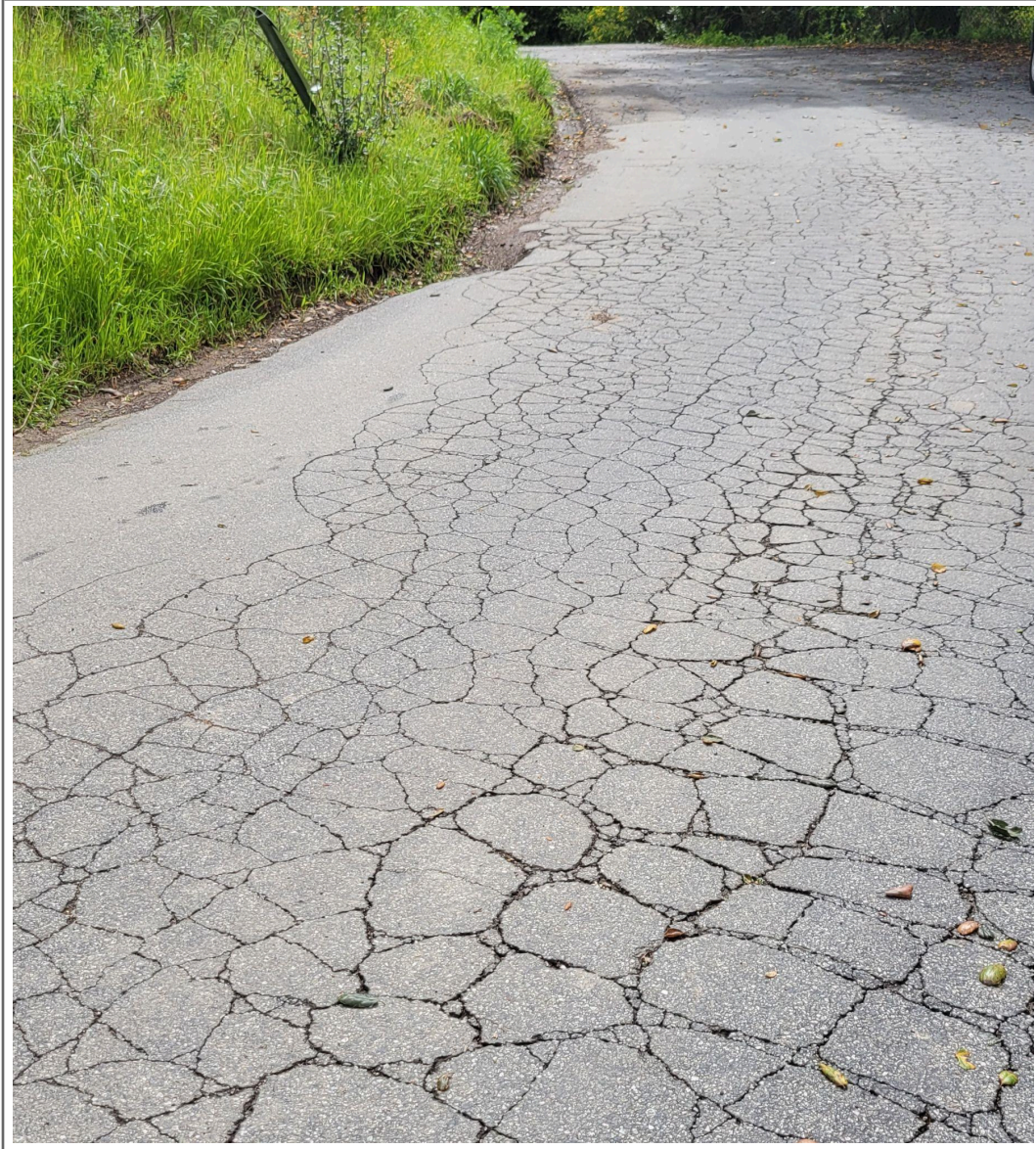
Figure 2. Mountain Charlie Road - PCI 16/100. [8]

To make matters worse, our County, for reasons that will be discussed, is in poor financial straits to the point where deferred maintenance of our road network is into the hundreds of millions of dollars and climbing. The County has lacked the financial resources to fix and maintain our roads using the general budget allocation. [4] As a consequence, the County relies on additional funding from outside sources. These include funds from Special District 9D 1-3 (1983), Measure D (2016), California Senate Bill 1 (SB1) (2017) and the most recent Measure K sales tax increase (2024). All these sources of funding help, but still leaves the County with a large funding shortfall. Most of this funding is allocated through formulas and the County has little discretion with how it can be spent.