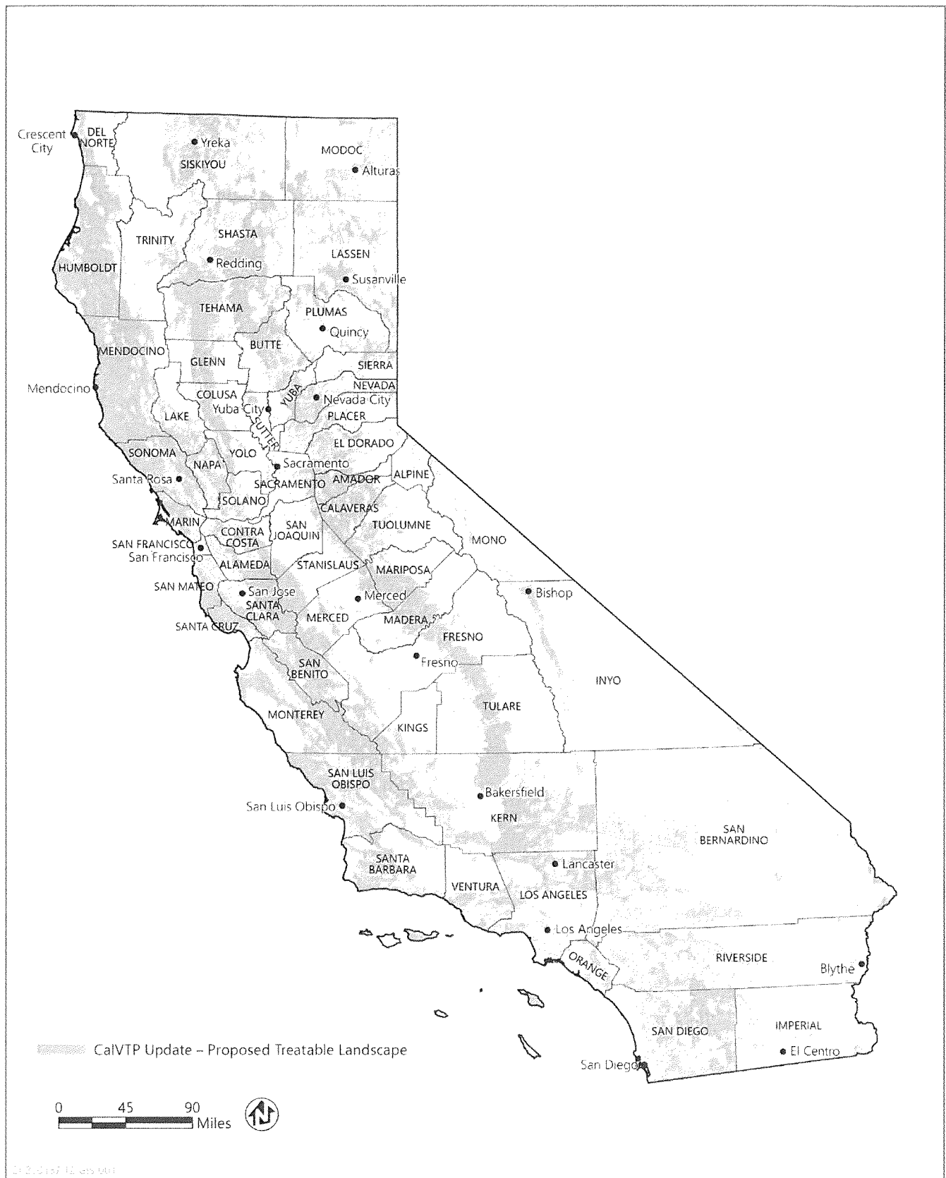
Figure 1 Proposed Treatable Landscape for the CalVTP Update Subsequent Program EIR