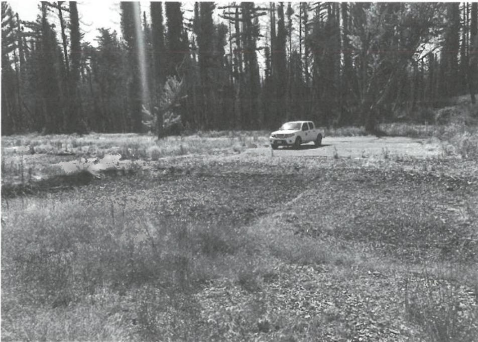
Photo 18 Walkway for Residence 15, view north