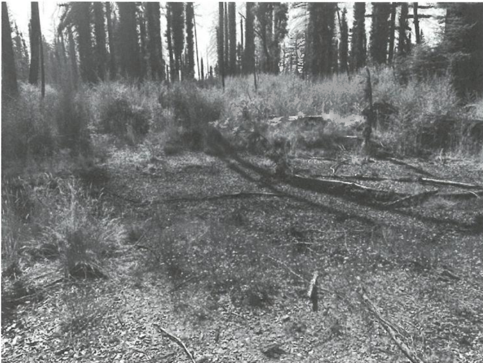
Photo 6 Footprint of Garage 8-10, view northwest