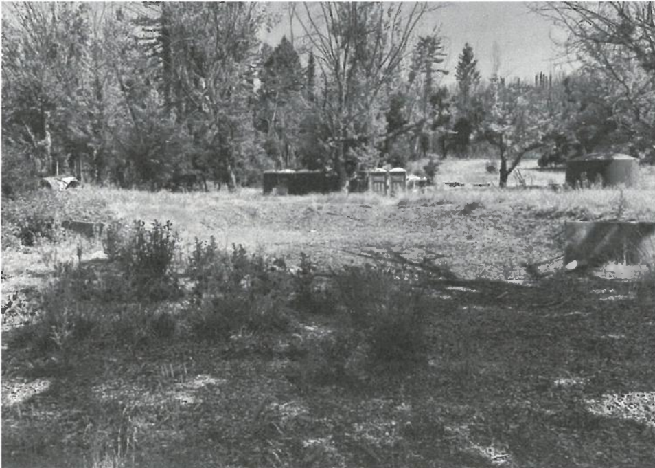
Photo 8 Footprint of Residence 8, view south