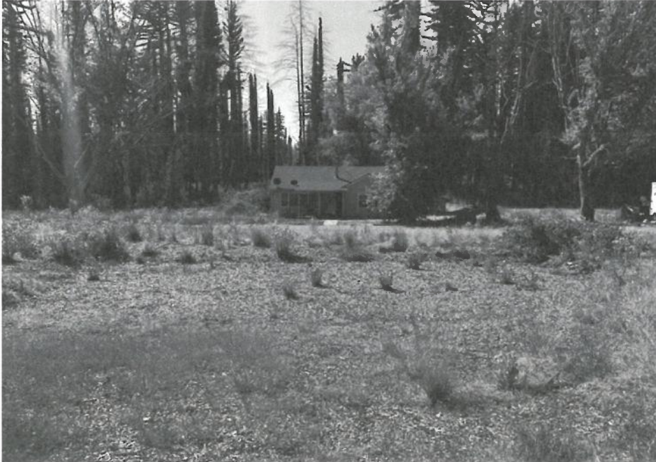
Photo 16 Footprint of Garage 14-16, view north