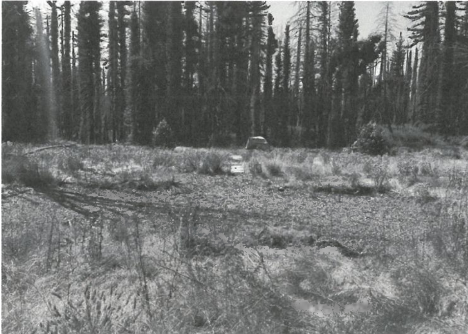
Photo 23 Footprint for Residence 14, view south