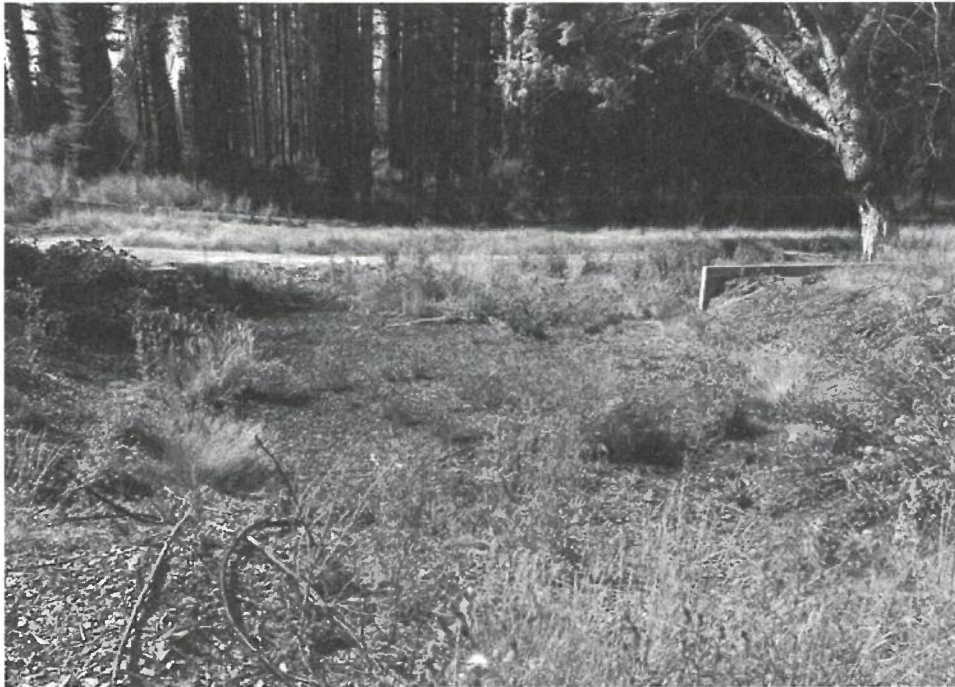
Photo 4 Footprint of Residence 9, view southeast