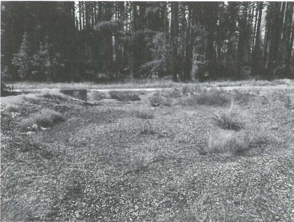
Photo 10 Footprint of Residence 7, view north