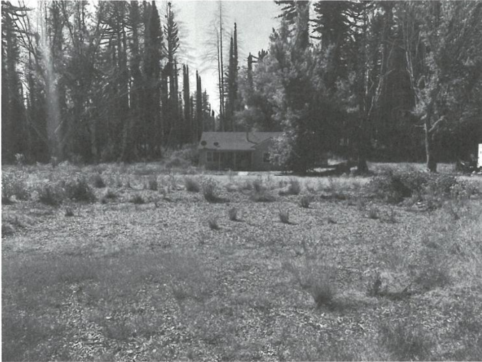
Photo 2 Footprint of Residence 9, view north