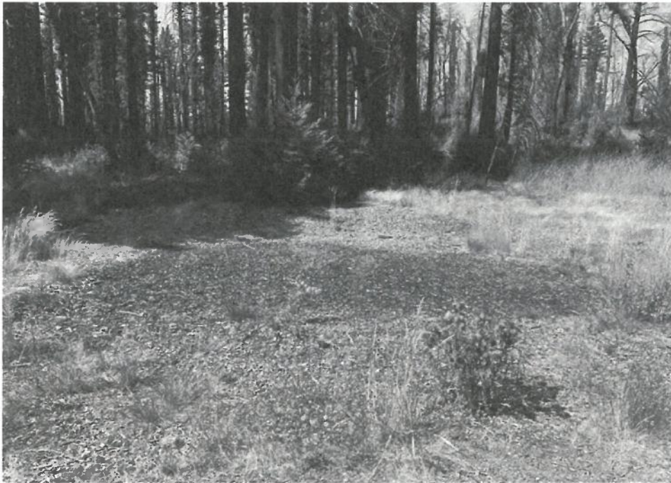
Photo 12 Footprint of Garage 7, view north northeast