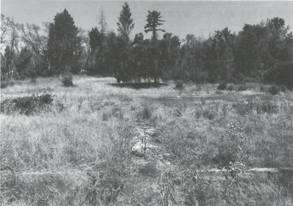
Photo 14 Footprint of Residence 16, view north