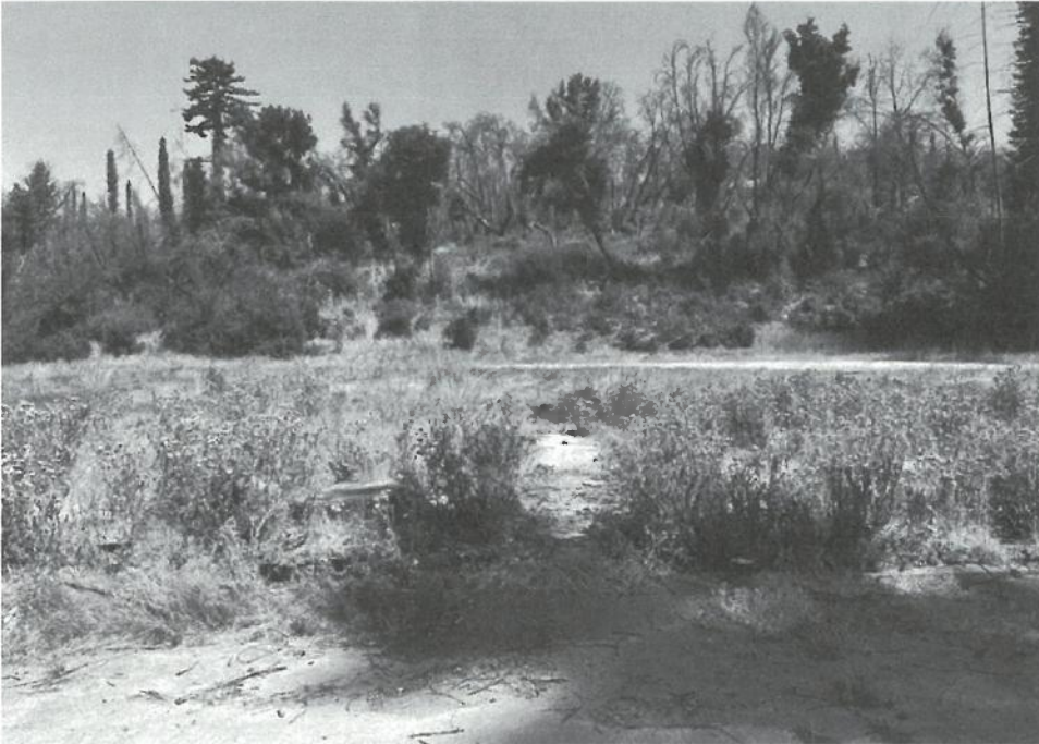
Photo 22 Footprint for Residence 14, view north