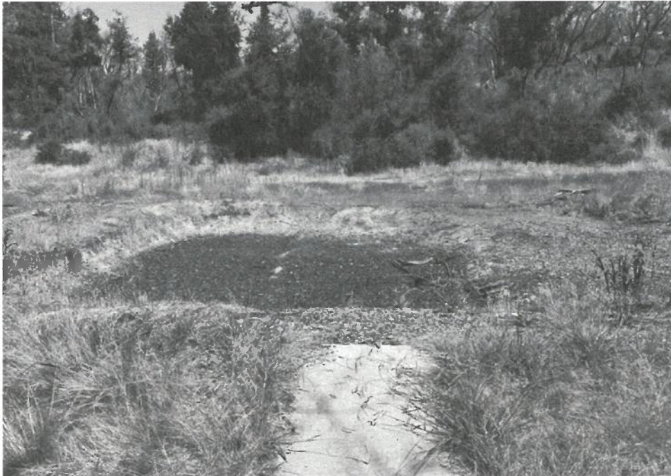
Photo 20 Footprint of Residence 15, view south