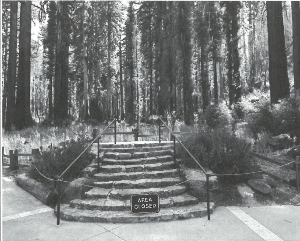
P5a. Photo or Drawing

P5b. Description of Photo: Headquarters Admin Building steps facing NE, 8/31/2023.