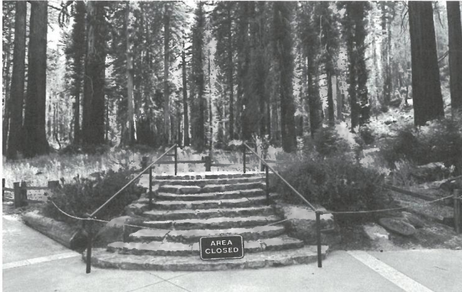
Photo 2 Concrete patio and steps, view south