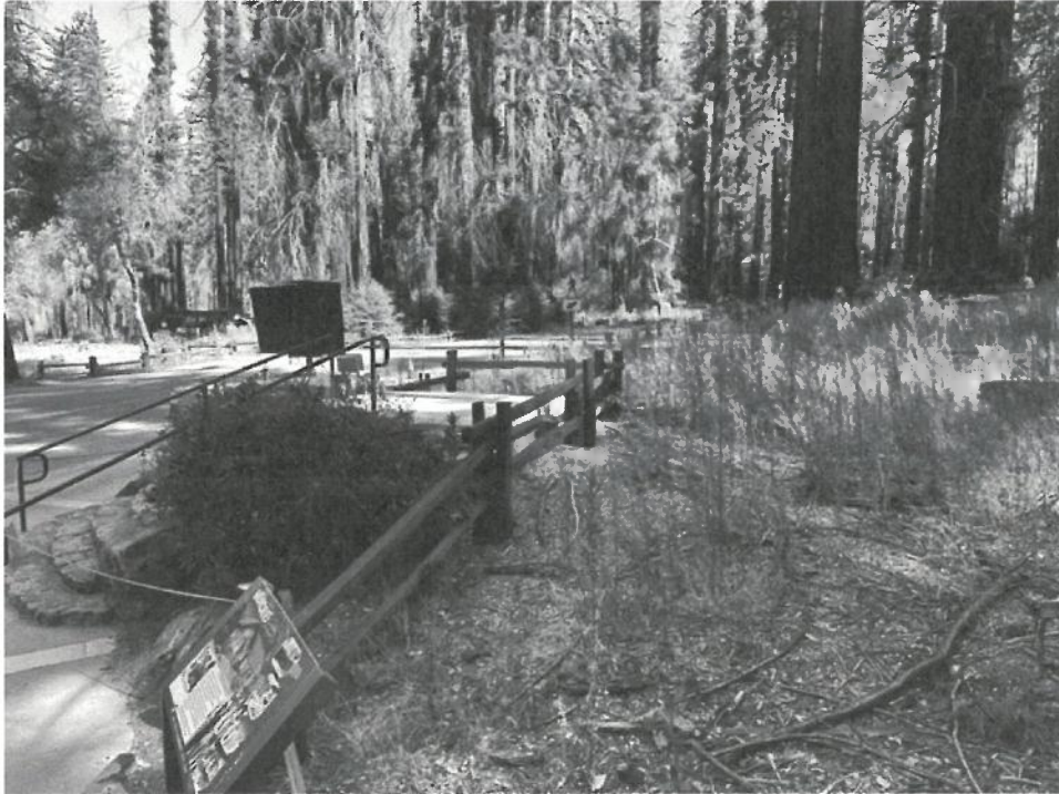
Photo 3 Concrete patio and steps, view northwest