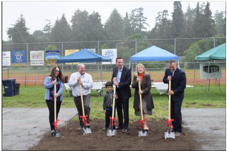
With assistance from the Cabrillo Host Lions Club, the County in April finally broke ground on long-planned concessions and bathrooms at Polo Grounds County Park. Look for the new building the summer!

We've updated our app to include fireworks reports, election results and much more, all at the touch of a finger. Download Citizen Connect for iTunes and Google Play.