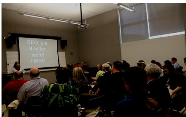
Search engine optimization was among the topics at the inaugural “82%: A Micro-Business Summit” at Cabrillo College.