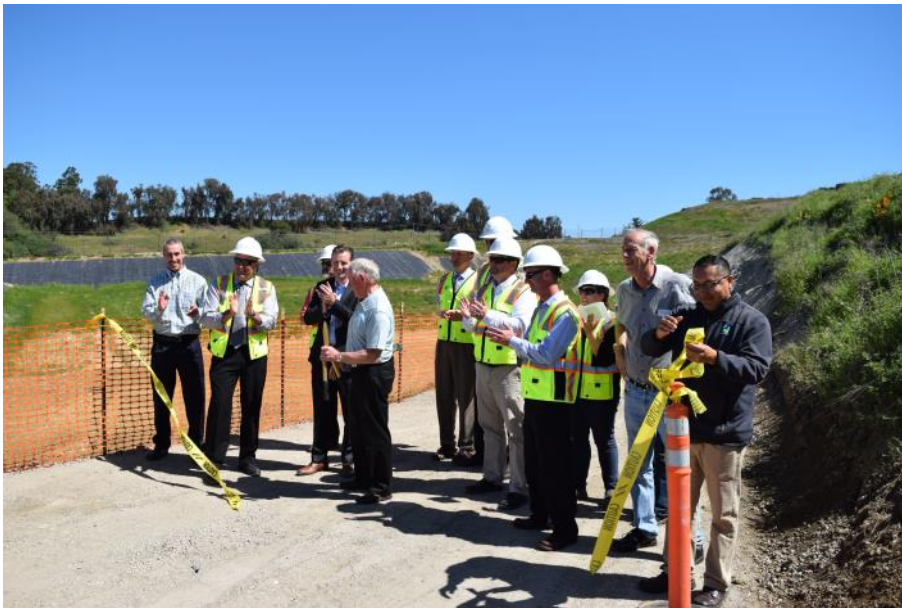
Board members and County staff celebrate the opening of the last section of Buena Vista Landfill